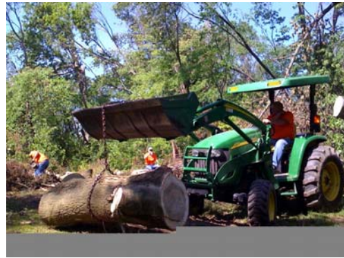
Team working in Herrin--Teams Return to Southern Illinois (See page 4)