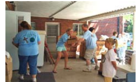
Cleaning at the Food Pantry

As volunteers sign up in the weeks before the day of the project, they are contacted by site coordinators to inform them of the work and preparation needed at each site. People of all ages and abilities are welcomed to participate. This year's event included participants from elementary school students to senior citizens.